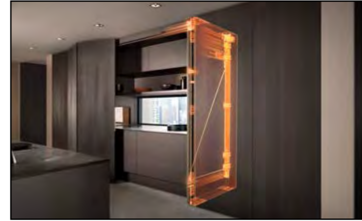
REVEGO pocket door

Blum will be onsite to answer all your questions with regards to REVEGO pocket door and HKi flap door systems. See first hand how these systems can be integrated into your product range from design through to machining and assembly.